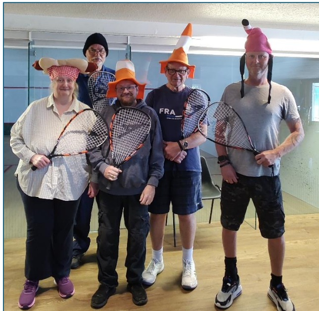
Our Racquetball team wearing 'Hats for Headway'

In July, we marked our 25th Anniversary with a BBQ attended by 98 guests, serenaded by a ukulele band—a true celebration of resilience and community.