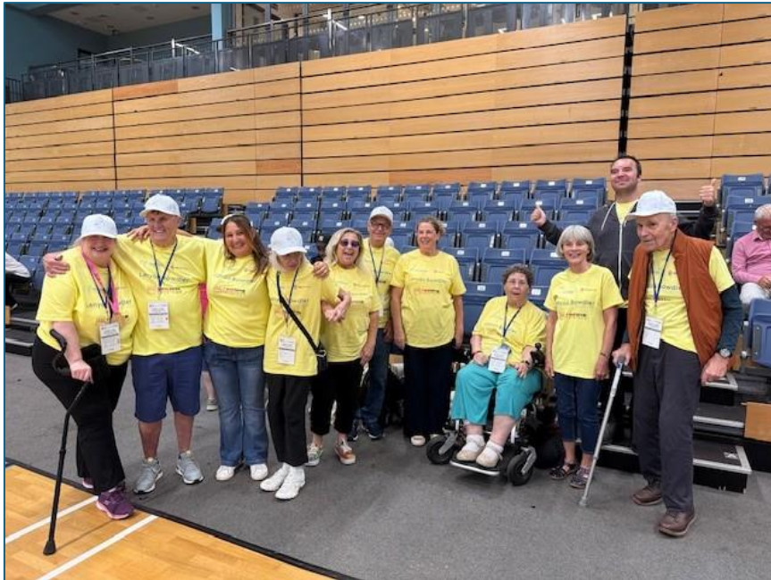
Herefordshire Headway resplendent in their yellow tee shirts at the ABI Games

In November, our Arts Exhibition opened at Herefordshire Archives & Records Office , showcasing woodwork, art, and pottery that powerfully proves life after ABI is creative, vibrant, and full of possibility.